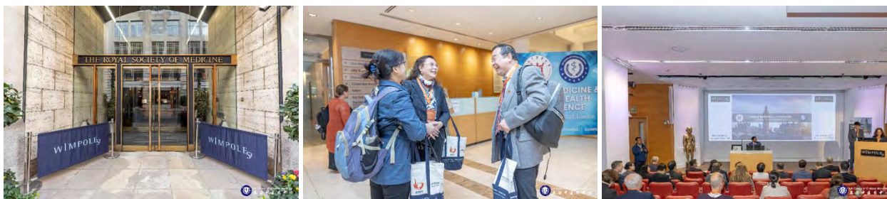
The Chinese Medicine and Human Health Conference 2023

The Chinese Medicine and Human Health Conference 2023 took place on 7 th and 8 th October 2023 in London, serving as a collaborative effort between the UK Centre of Chinese Medicine and the Shanghai University of Traditional Chinese Medicine.